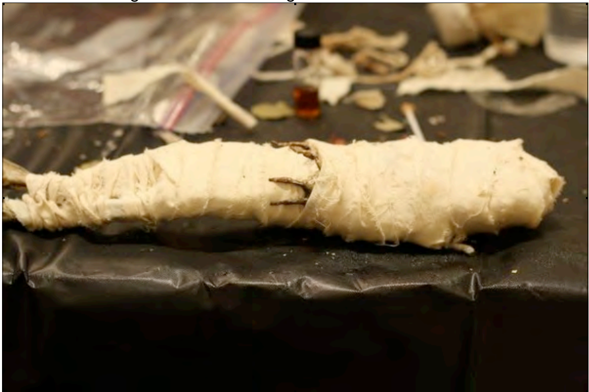
Wrapping the frog