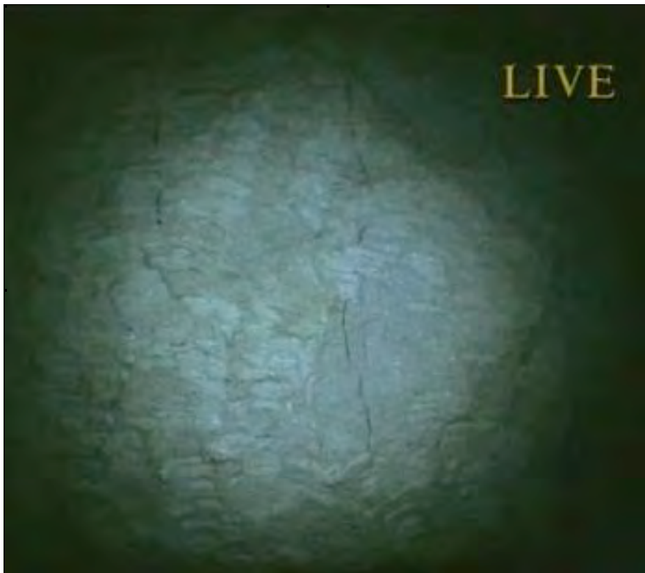
Photo 3. The coarse slab that lay beyond the fake chamber.

'Well its a slight of hand trick, the old swap the card while the eye isn't looking game, Zahi Hawass had us believe that the chamber was going to be drilled, and its secrets would be revealed, live on TV., before the world. When in actually fact he used a fake chamber, a fake door, which was drilled, revealing nothing but a coarse slab, fooling the world into believing that nothing of any interest lay behind the mysterious door, thus keeping the original and real chamber for himself, and also the secrets that lay beyond it.