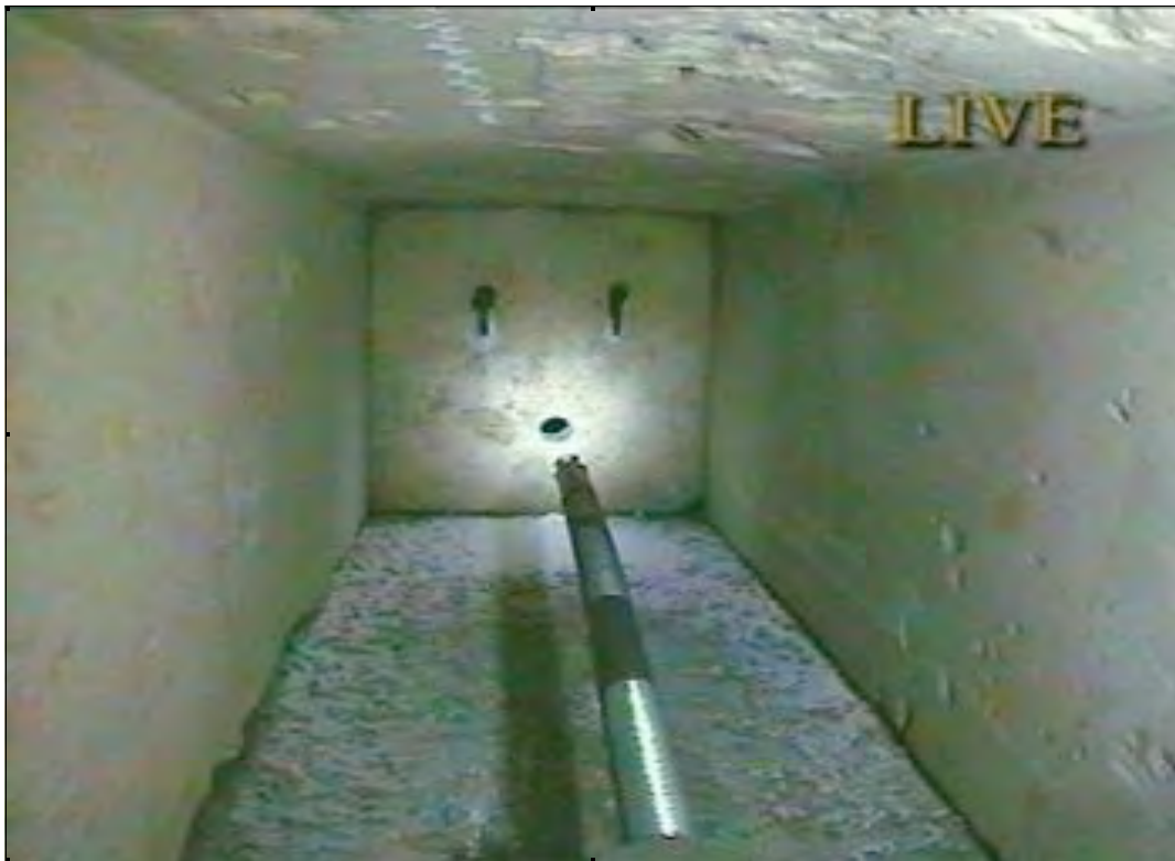
Photo 2. Whilst the robot is deployed, notice the smooth walls and the short, stumpy copper handles.