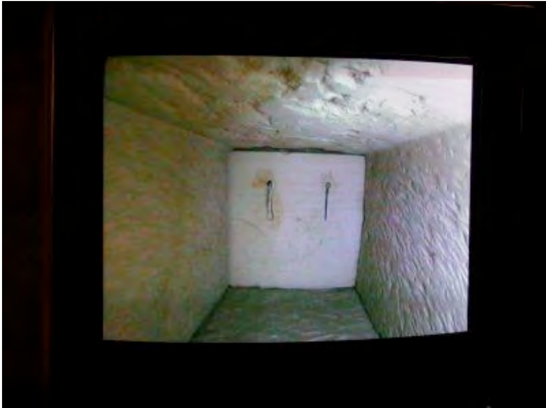
Photo 1. Before the robot was deployed, notice the rough textured walls, and the elongated copper handles.