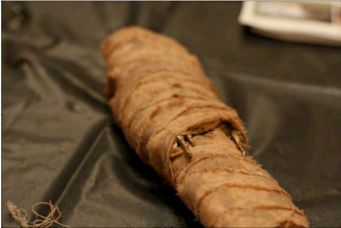
The final product: a mummified frog (Note the toes hanging out of the wrappings)