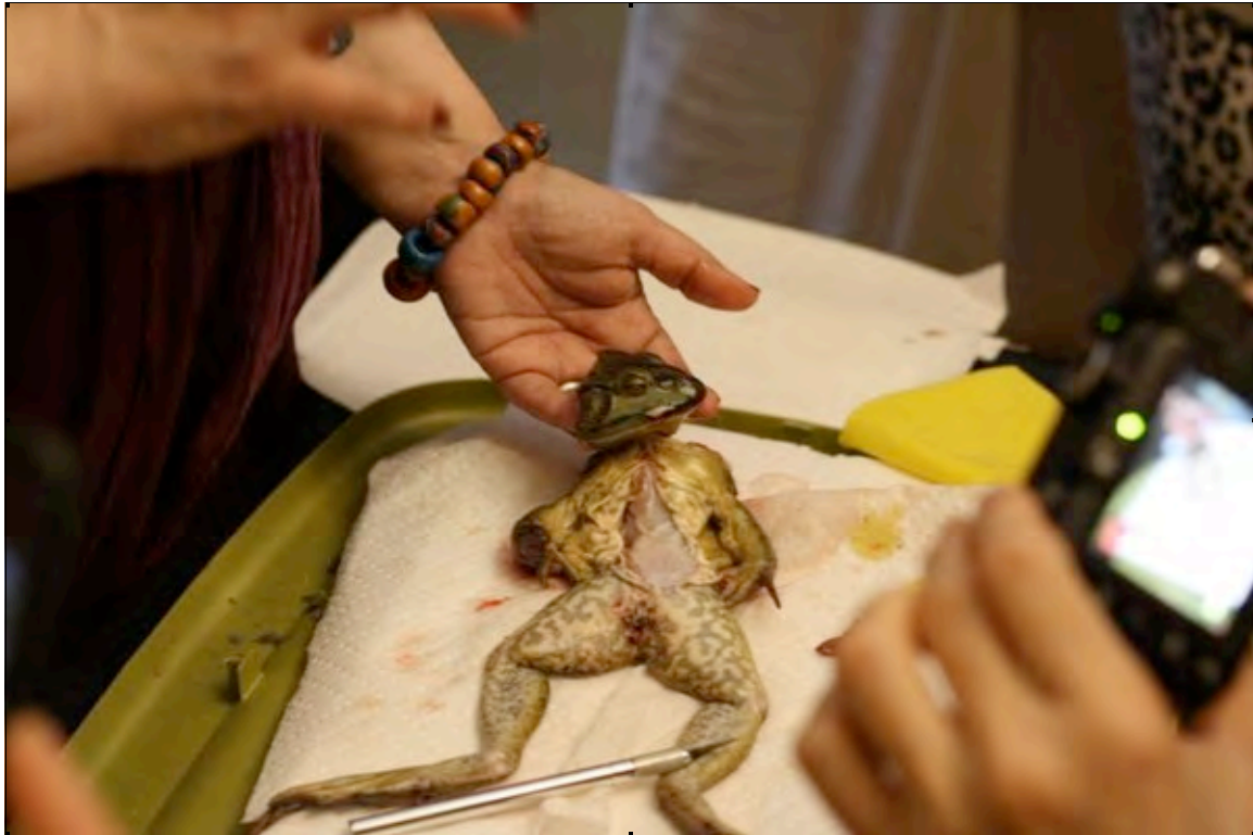
Dissecting a frog for mummification

'Cagliastro, adorned in black and purple, stood in front of the 18 frogs, prepared to describe her carefully researched interpretation of the Ancient Egyptian practice of mummification. "Everyone knows what it is, but no one knows how it is done," she said.